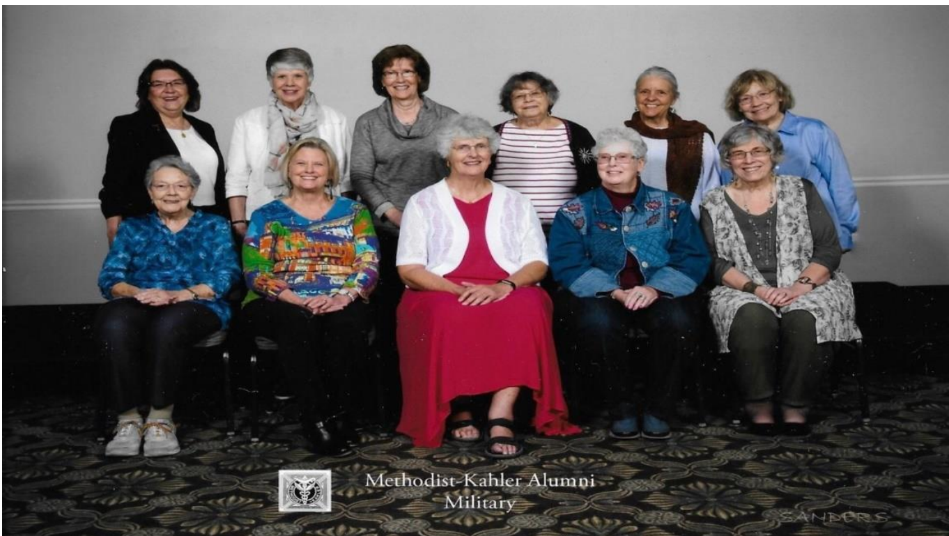
Just some of the Alumni who served in the Military